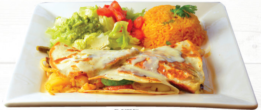
EL PATRON SPECIAL

WE COOKED OUR FOOD DAILY WE USE VEGETABLE OIL