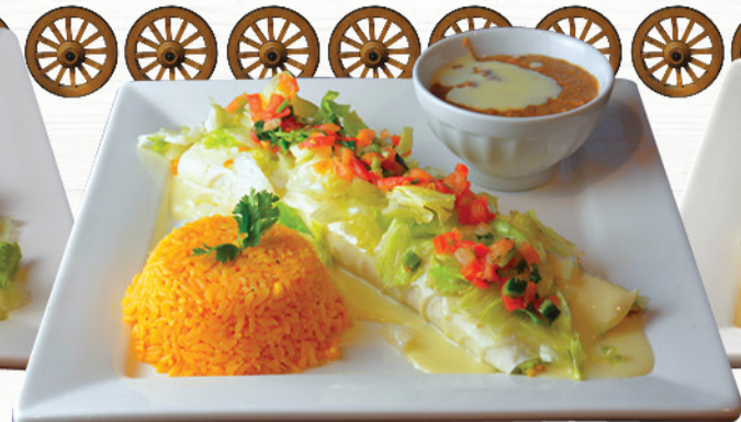
CHEESE STEAK BURRITO