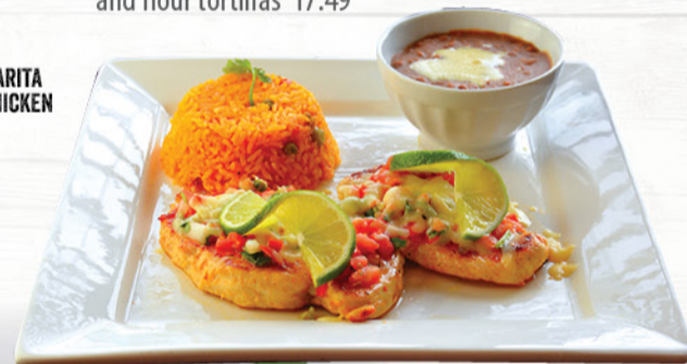
MARGARITA LIME CHICKEN

A species of cactus that has been valued in Mexico since Aztec times for its curative and nutritional properties, rich in vitamins C, B, B2 & minerals. The nopal has been incorporated in many of our dishes