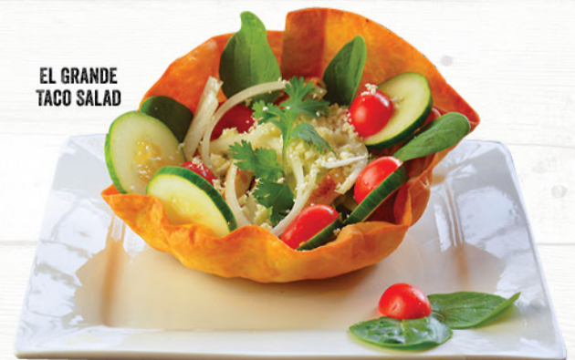
EL GRANDE TACO SALAD

*Notice: Foods cooked to order, consuming raw or undercooked meats, poultry, seafood, shellfish or eggs may increase your risk for food borne illnesses, especially if you have certain medical conditions.