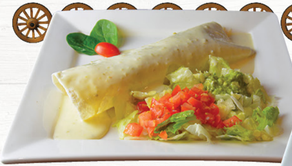
GRANDE BURRITO FAJITA