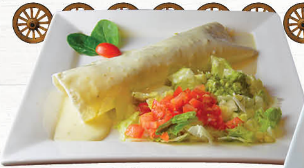
GRANDE BURRITO FAJITA