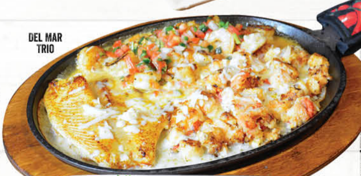
DEL MAR TRIO

GRAN FIESTA SPECIAL Shrimp, lobster and tilapia with steamed vegetables, topped with cheese sauce and slices of tomatoes 23.99