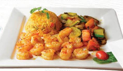
CAMARON AL MOJO DE AJO