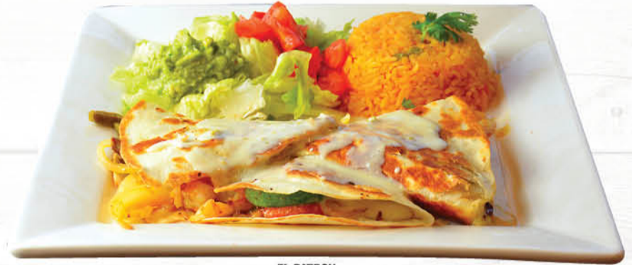
EL PATRON SPECIAL

WE COOKED OUR FOOD DAILY WE USE VEGETABLE OIL YOU CAN SUBSTITUTE RED SAUCE FOR CHEESE SAUCE ADD 1.99 EXTRA