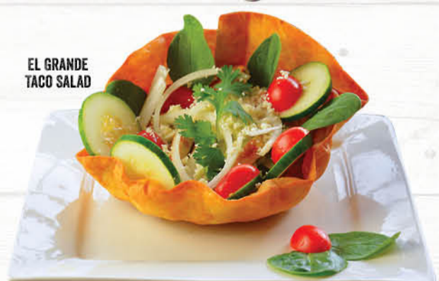
EL GRANDE TACO SALAD

*Notice: Foods cooked to order, consuming raw or undercooked meats, poultry, seafood, shellfish or eggs may increase your risk for food borne illnesses, especially if you have certain medical conditions.