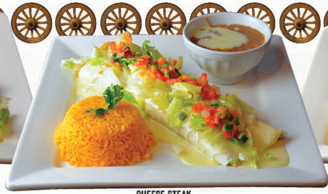
CHEESE STEAK BURRITO