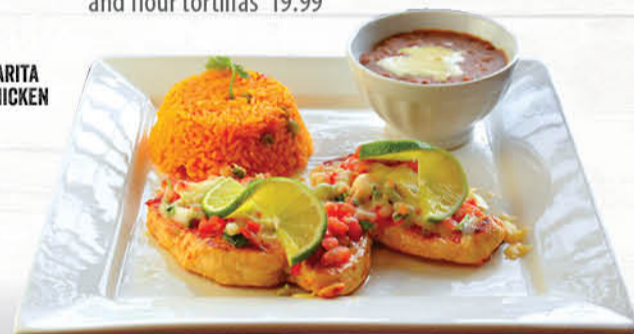
MARGARITA LIME CHICKEN

Grilled steak, topped with grilled mushrooms, onions, zucchini, tomatoes and melted cheese. Served with rice, beans and flour tortillas 19.99