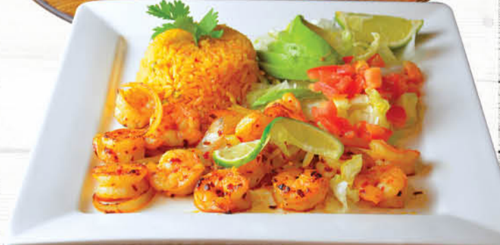
CAMARON AL CHILE DE ARBOL

*Notice: Foods cooked to order, consuming raw or undercooked meats, poultry, seafood, shellfish or eggs may increase your risk for food borne illnesses, especially if you have certain medical conditions.